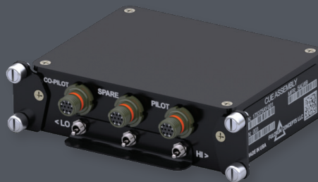
DZUS Rail Adapters