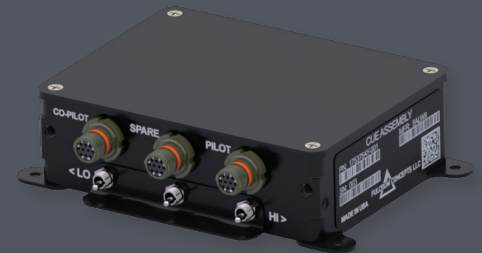
Mounting Feet Adapters