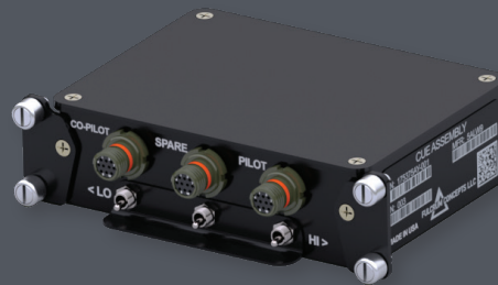
DZUS Rail Adapters