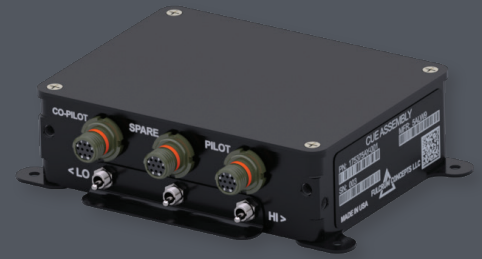
Mounting Feet Adapters